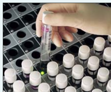
Step 3: Load where indicated by green light.