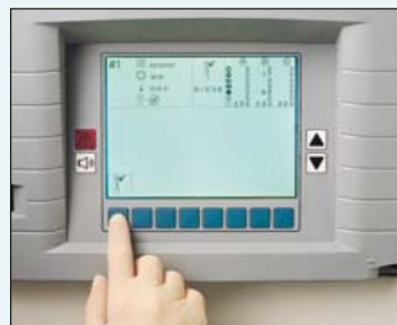
Step 1: Select workflow.

Guides the simple 4-step operating procedure, eliminating potential errors.