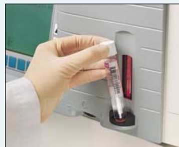
Step 2: Scan tube at instrument.